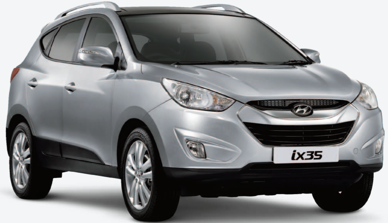
Highlander model shown in Sleek Silver.

All Genuine Hyundai Accessories are covered by Hyundai's Australian First 5 Year/Unlimited Kilometre Accessories Warranty*. Please refer to www.hyundai.com.au/ix35 for full details.